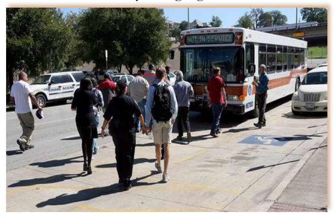
Figure 7: Witnesses boarding a Capitol Metro bus

Officers identified 17 witnesses and moved them to a secure location inside of Gregory Gym, which was adjacent to the incident command post. The APD commander apprised the UTPD sergeant of the assets APD could provide to assist, including a Capital Metro bus and 15 homicide detectives. A plan was made to bus the witnesses to the APD Main Headquarters (less than 1.5 miles away) where the detectives would take statements. While the bus was en route to pick up the witnesses, three UTPD detectives took verbal statements from the witnesses. The detectives tried to determine if there was credible information regarding a second suspect. The witness statements varied but were similar enough to believe there was only a single gunman.