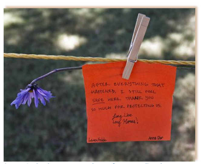
Figure 16: Thank you notes to law enforcement line the campus West Mall

The overarching reason for the successful management of this event was made clear in every area's review—effective collaboration among multiple law enforcement agencies made possible by regularly training together. Training facilitates these working relationships. This report also identified many lessons learned, and we have started to address the challenges and implement some of the recommendations as they relate to personnel, training, procedures, equipment, and technology.