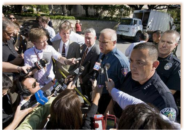
Figure 13: President Bill Powers, Mayor Lee Lefingwell, UTPD Chief Robert Dahlstrom, and APD Chief Art Acevedo conduct a press conference near the scene

The next press conference was conducted at approximately 1 p.m. at the AT&T Executive Education and Conference Center. This location was one of two locations (LBJ Library is the second location) pre-chosen for press conferences for any major event on campus. These locations were chosen because the buildings are equipped with the necessary technology, parking is accessible to satellite trucks and other press vehicles, and both locations are also on the outer edge of campus for easy ingress and egress for the press corps.