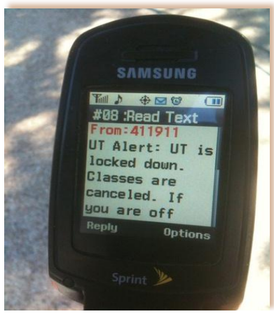
Figure 11: UT text alert

The first emergency call was reported to the UTPD Communication Center at 8:12 a.m. UTPD has two operable dispatch consoles. The primary dispatcher received the first telephone call and the second dispatcher assisted. All units were dispatched immediately. The center was inundated with telephone calls, so additional personnel were summoned to answer calls. The two communication operators concentrated on radio traffic. UTPD had previously trained civilian personal so in the event of an emergency, they could assist and they did.