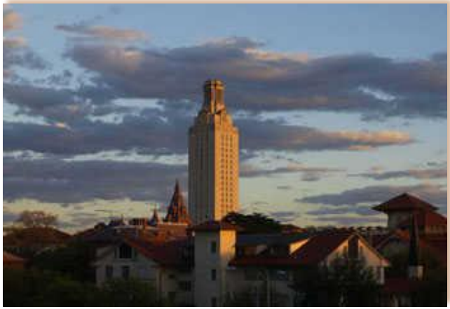
Figure 2: The university Tower at sunrise

The university's reach goes far beyond the borders of the main campus with satellite campuses and research centers across Texas, including the J.J. Pickle Research Campus and the Brackenridge tract in Austin, the Marine Science Institute in Port Aransas, and the McDonald Observatory in Fort Davis, Texas.