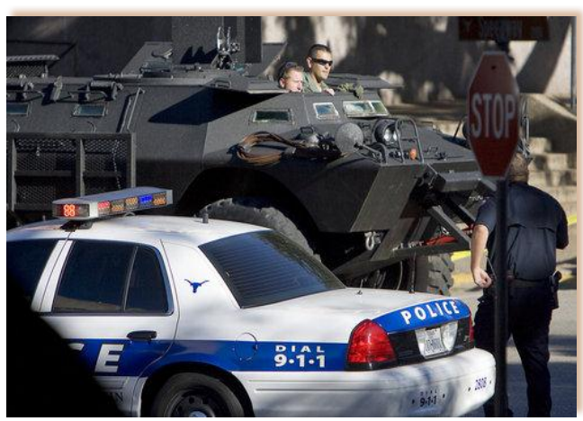
Figure 4: Officers in an APD emergency response vehicle—an "armored bear cat"

The on-scene commander, advised two APD officers to stay with the body, while the search of PCL continued. UTPD Captain Don Verett arrived on the 6<sup>th</sup> floor and assumed command of the interior crime scene.