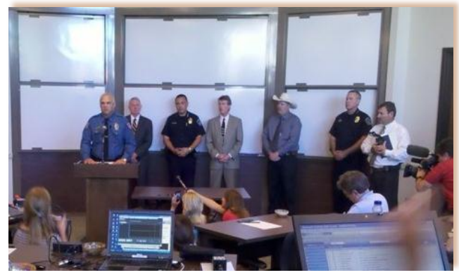
Figure 14: UTPD Chief Robert Dahlstrom speaks to the media at a press conference in the AT&T Executive Education and Conference Center

Over the next two days, the UTPD Chief of Police conducted approximately 10 interviews each day. Most news stations preferred a one-on-one interview.