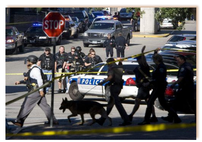
Figure 6 K-9 unit conducting campus search

At approximately 12:20 p.m., unified command shrank the perimeter as buildings were searched and cleared of any suspects. They also developed a demobilization plan that included a staggered release of students, faculty, and staff inside buildings. UTPD used the siren system voice over to direct the release of the community starting with the north side of campus. The command post was closed at approximately 12:45 p.m.