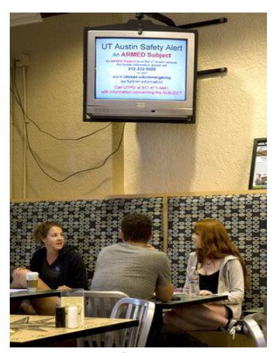
Figure 10: UT Safety Alert on campus closed cable

The EOC remained in contact with University administrators throughout the event. Following the initial text alert, siren notification, and Facebook posts, the EOC initiated and maintained communication with the university community through RSAN, Email, DEVIS