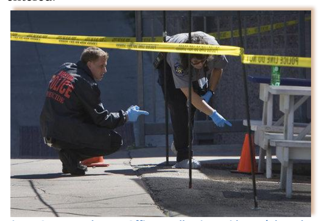
Figure 8: APD and UTPD Officers collecting evidence

A UTPD detective then went to the PCL video room to view the security footage and determine if one or more shooters entered. Staff members from Information Technology Services (ITS) and PCL assisted with obtaining the video footage that verified that only one person with a gun had entered.