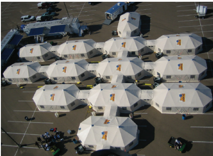
Thirteen 1935s connected by vestibules make up this field hospital.

Beds, work stations, tables, seating and food prep