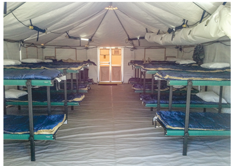
Shelter billeting featuring Western Shelter bunk beds, air distribution plenum, lighting and wiring harness.