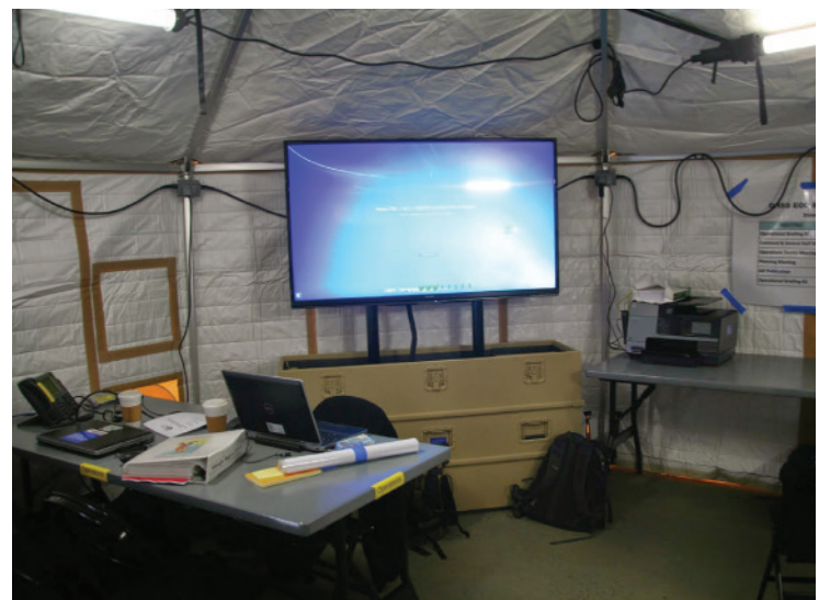
20 system shelter featuring SOI equipment set up and ready for use.